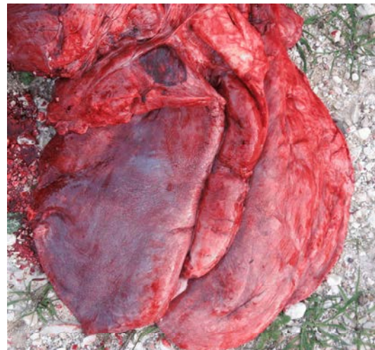
Fig. 3: Complete pulmonary collapse in a case of ruptured diaphragm in a horse.